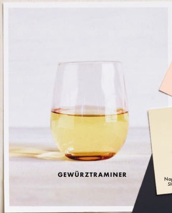
Green Hornet 075-4; Mythic