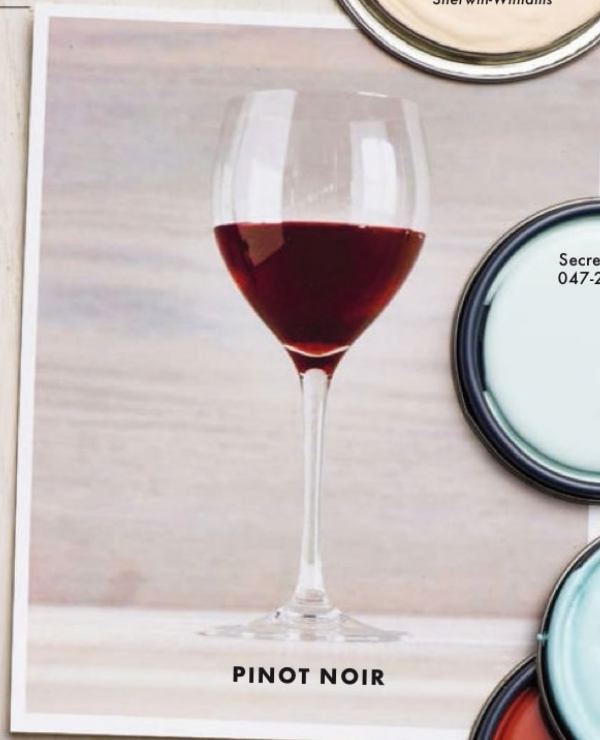
Creamery SW 6358; Sherwin-Williams

Bench 2013 Pinot Noir from Brack Mountain Wine Company ( Sonoma Coast ; $24); Chehalem 2012 Ridgecrest Vineyards Pinot Noir ( Ribbon Ridge ; $50); Sokol Blosser 2012 Pinot Noir ( Dundee Hills ; $45).