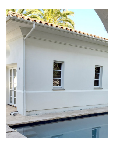
"It's important for me to make sure I use quality paint I know will work. Dunn-Edwards gives me that."

"We are a family business and I get to know my customers very well," he added. "It's important for me to make sure I use quality paint I know will work. Dunn-Edwards gives me that."